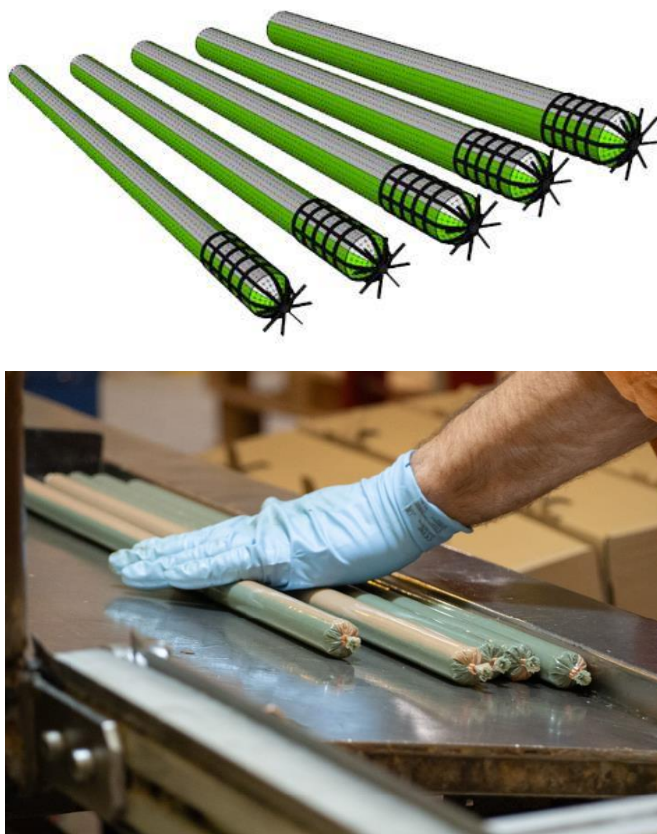
Figure 2. Illustrative (upper) and production (lower) picture of the Lokset resin capsules

More information about Lokset resin capsules can be found on the MINOVA EKOCHYM Sp. z o.o. website www.minovaglobal.com