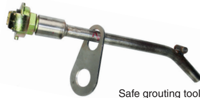
Safe grouting tool