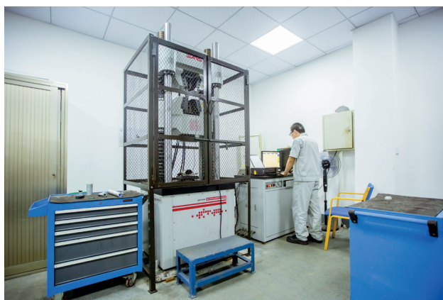
Pretec China laboratory