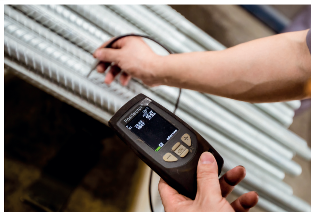
Control of coating thickness