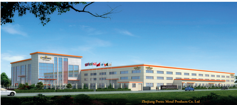
Factory in Haining, Zhejiang, China. Total area: 22000 m2. Content: mechanical production, hot dip galvanizing and powder coating.

Product data sheets and brochures for both bolt types can be downloaded from www.pretec.no