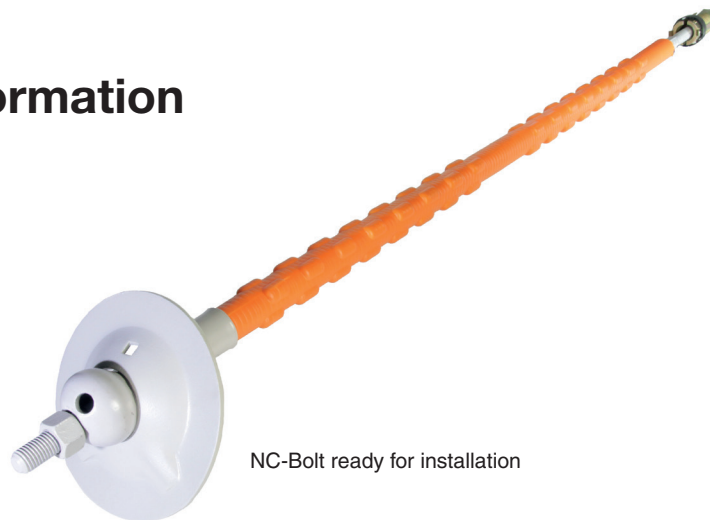
NC-Bolt ready for installation