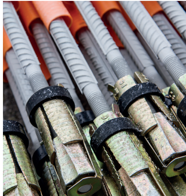
Nc-bolts with mounted expansion shells