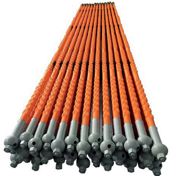
NC-Bolts packed on pallet.