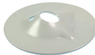
Spherical bearing plate