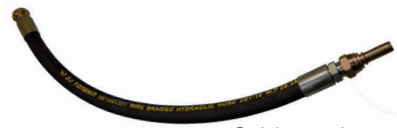
Quick grouting tool